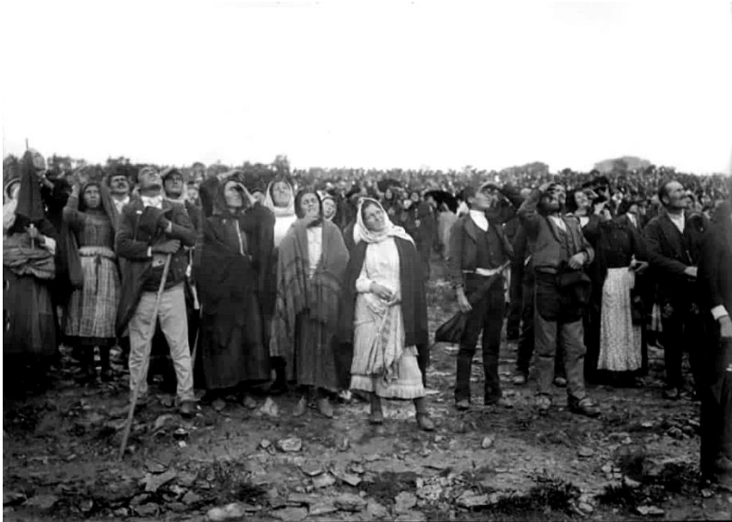
During the apparition, the sun began spinning and appeared to fall from the sky toward the people. It then went back up to the sky and the people were instantly clean and dry. This shows the people looking at the sky.

On December 10, 1925, Sr Lucy received an apparition by the Child Jesus and the Virgin Mary in her convent cell. The Holy Virgin shown her a Heart surrounded by thorns, Our Lady said to her: