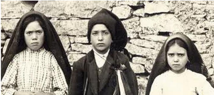
The three children (Lucia - who became a nun and just died 10 years ago, and her two cousins, Francisco and his sister Jacinta, who died just a few years after the apparition.)

wishes to establish in the world the devotion to My Immaculate Heart. If people do what I tell you, many souls will be saved." Then She said: " If my requests are granted, Russia will be converted and there will be peace. If not, she will scatter her errors throughout the world, provoking wars and persecution of the Church. The good will be martyred, the Holy Father will have much to suffer, and various nations will be destroyed...But in the end, my Immaculate Heart will triumph. When you recite the Rosary, say at the end of each decade: Oh My Jesus, forgive us our sins, save us from the fires of hell, and lead all souls to Heaven, especially those in most need of Your Mercy." Pray, pray a lot and offer sacrifices for the sinners. You know that many souls go the hell because there is none who pray for them."