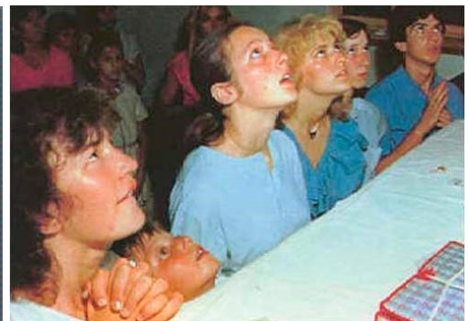
The visionaries in ecstasy - one being tested by scientists with electrodes. See notes at bottom of document related to the testing.