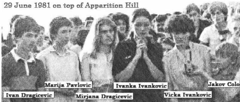
29 June 1981 on top of Apparition Hill

The yearly anniversary of Medjugorje is celebrated on the 25th of June at Our Lady's request. But the first day Our Lady actually appeared in Medjugorje was June 24, the feast of the birth of St. John the Baptist. 2000 years ago, St. John the Baptist called for repentance and prepared the way for Jesus. It is the same way now. The apparitions began on his feast day and Our Lady is telling us, repent and prepare for Jesus to come. She says these are the last apparitions on earth, that she will no longer appear on this earth as she has for 2000 years. The first apparition of the Blessed Mother was to St. James in Zaragoza Spain on January 2, 40 AD just 7 years after Jesus was crucified. St James is the name of the church in Medjugorje.